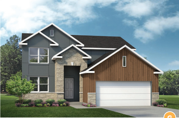
*Stucco finish *Shown with optional garage door

Minor updates to elevations and floor plan will be finalized soon. See sales manager for more details.