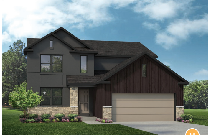
*Stucco finish *Shown with optional garage door