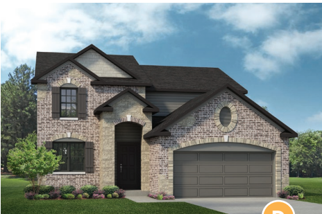
*Shown with optional masonry return